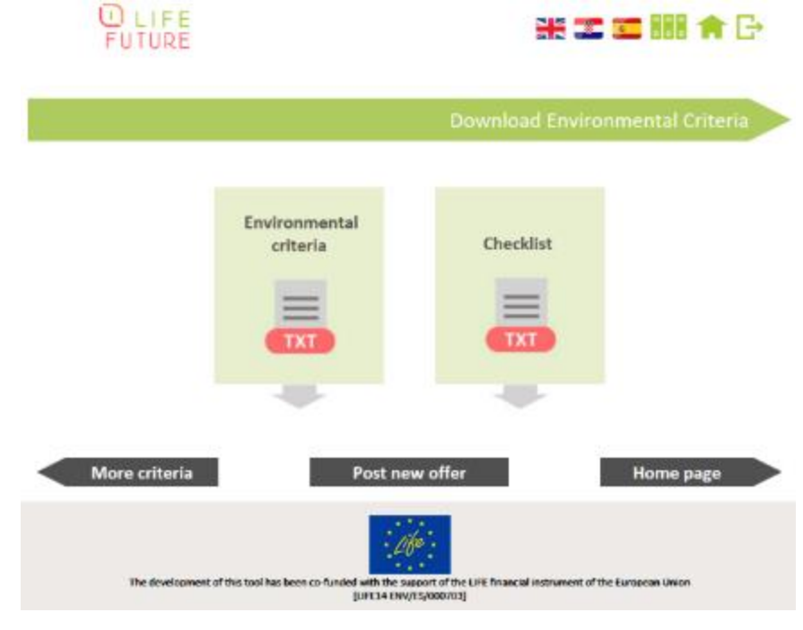
Downloading page after you select the criteria you wish to appear on the ToR document of your tender

Use the "Verification requirements" button to see what shall be asked for the providers to be fulfilled. Finish your selection, generate your documents and download in PDF both the environmental criteria to be attached to the ToR and the Check list that serves for evaluating the offer you have from providers.