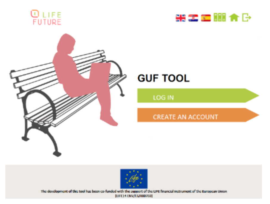
Homepage for the online GUF Tool developed within the LIFE FUTURE project

We have a tool for you, ready to be tested!