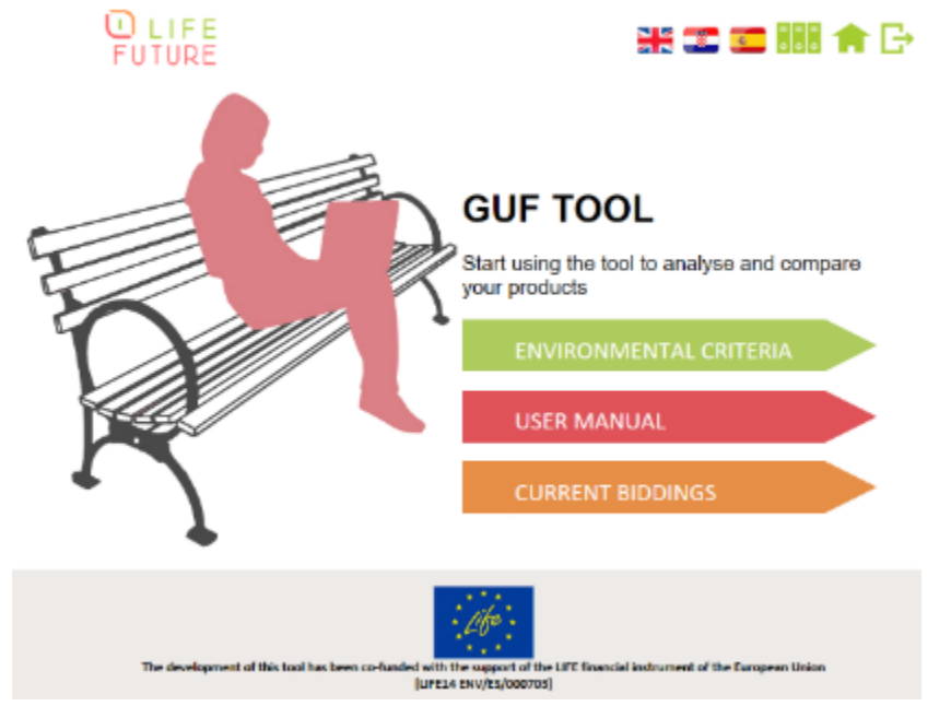
Main page for the online GUF Tool once you log-in

Please be exhaustive: we use this data for statistics. YOUR DATA ARE SECURE and only be used for this purpose. Once you get the confirmation e-mail, you can start using the GUF Tool after log-in in it. Please note this is a DEMO VERSION, and some pages are not active: we are developing the full manual and the rest of the tool features.