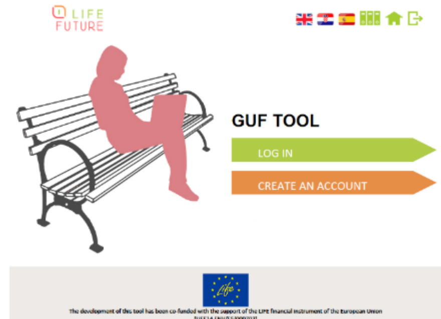
Homepage for the online GUF Tool developed within the LIFE FUTURE project

Go through the URL for the online GUF Tool <u>http://lifefuture.uji.es/</u> Please register as new user by Creating a new account.