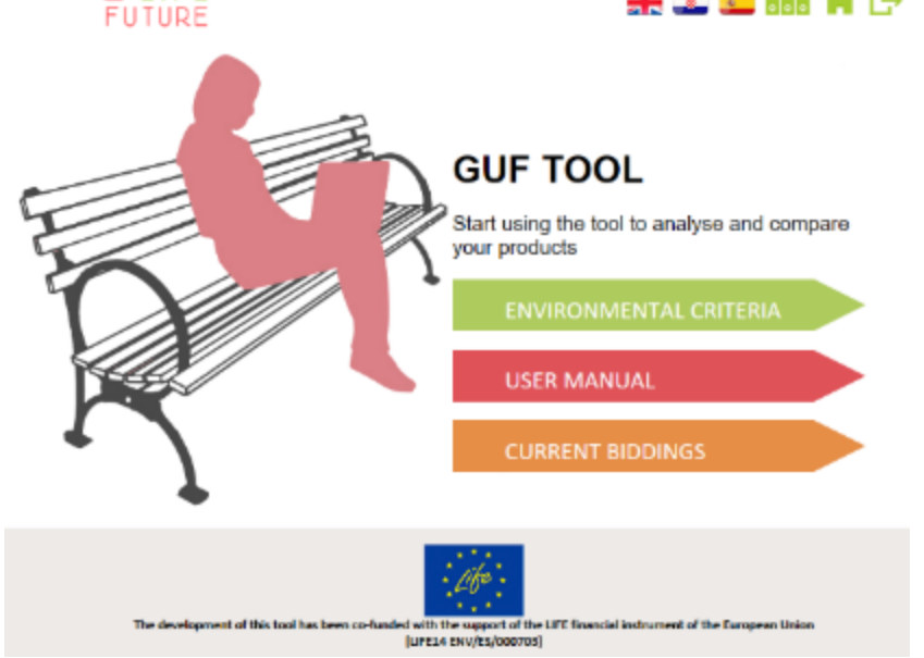
Main page for the online GUF Tool once you log-in

You can now select which environmental criteria you wish to check you need to comply: criteria depending on the materials you are using or products you are planning to offer.