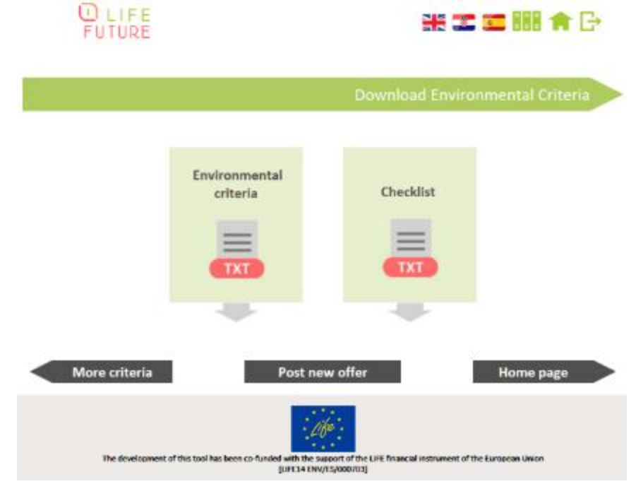
Downloading page after you select the criteria you need to fulfil and the check list for your evaluation

Finish your selection, generate your documents and download in PDF both the environmental criteria asked to be complied and the Check list that serves you for evaluating the offer you provide.