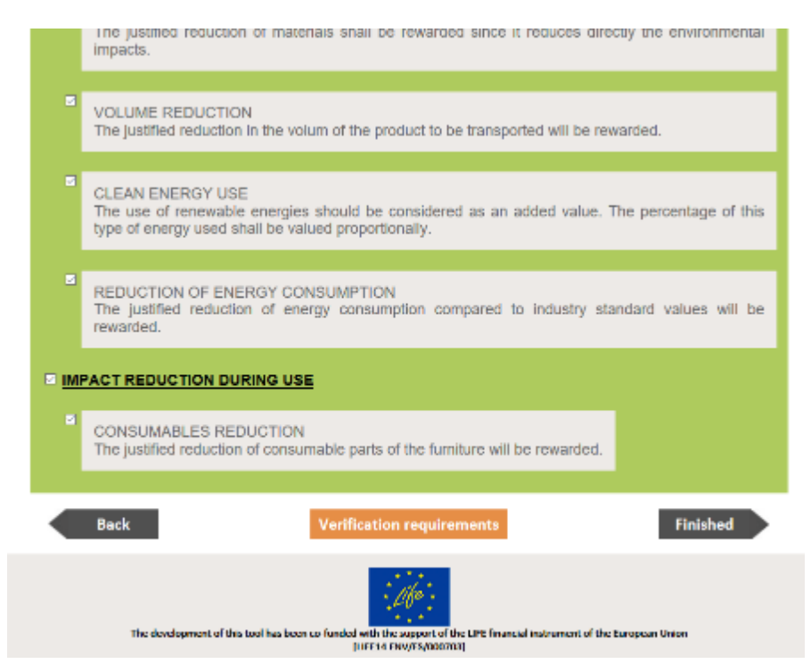
Potentially applicable criteria appear automatically: just unselect those not included on the tender

Check and uncheck as you wish to have the most accurate set off criteria as described within the Terms of Reference (ToR) of the published tender.