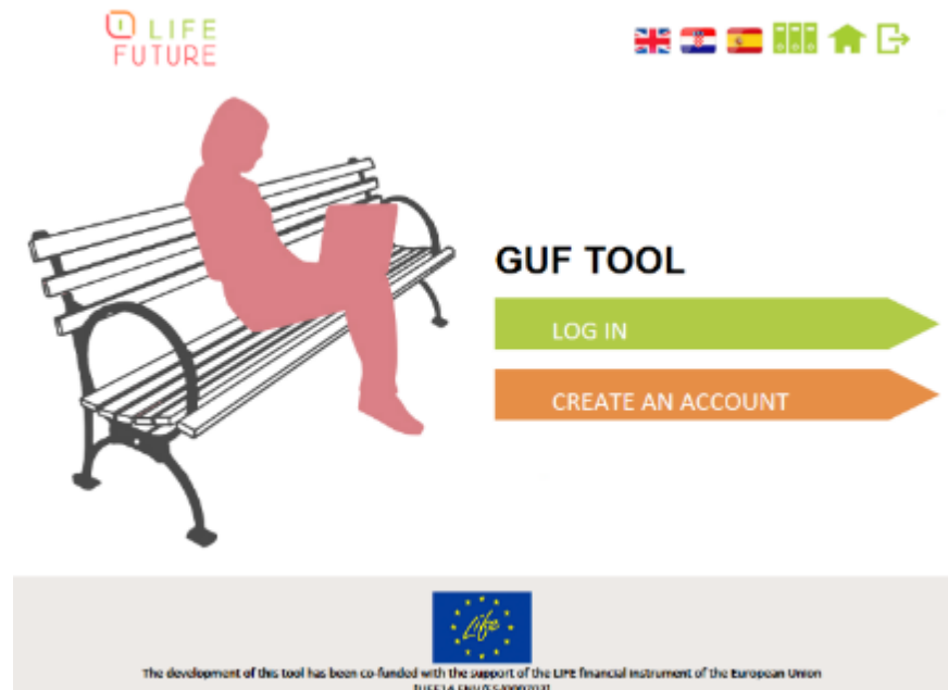
Homepage for the online GUF Tool developed within the LIFE FUTURE project

Go through the URL for the online GUF Tool <u>http://lifefuture.uji.es/</u> Please register as new user by Creating a new account.